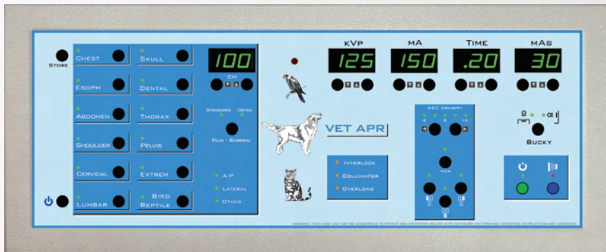
VET APR CONSOLE

Install a complete system in less than 4 hours. Light weight structural aluminum tubing design. Less than 1/2 weight of conventional system: 600 lb Net, 700 lb Gross Shipping